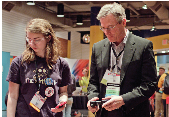
Paul Jacobs, executive chairman of Qualcomm Incorporated, with a FIRST Tech Challenge team member, driving a robot powered by a Snapdragon processor.

“We’ve seen so many positives as a result of collaborating with FIRST on this solution,” says Paul Jacobs, executive chairman, Qualcomm Incorporated. “Thousands of kids who participate in FIRST Tech Challenge are now exposed to the power of Snapdragon as they program and control their robots using smartphones.”