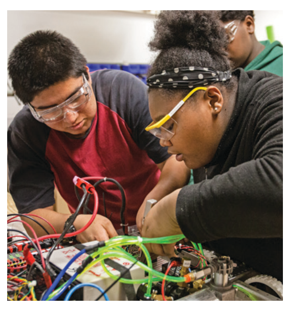
Students work on a robot at Ypsilanti STEMM Middle College, in Ypsilanti, Michigan.