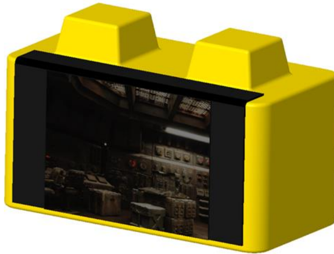
Figure C-2 Skystone