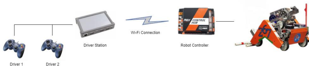
Figure 2: Point-to-point connection between the robot controller and driver station.

It is important to note that with a point-to-point control system, each driver station-robot controller pair establishes its own independent wireless network.