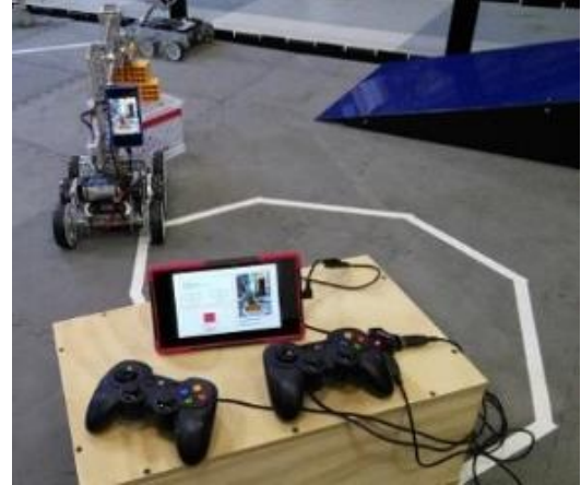
Figure 1: Driver Station Device connected wirelessly to a FIRST Tech Challenge Robot

More information about the control system used in FIRST Tech Challenge can be found on FTC Docs in the Control System Section and from the primary control system vendor REV Robotics technical documentation .